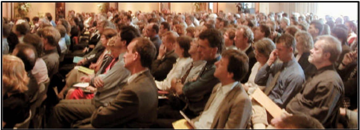
Massed Devon GPs listening to the GPC presentation "Your Contract, Your Future" at Dawlish

Only a brief bit from me today as life is particularly hectic at the Secretariat Office. Our move to new premises is progressing but less smoothly than I would like. You will get a special flyer with all the new details as soon as everything is confirmed. LMC Conference next week takes up planning time as does trying to work effectively with eight "new" Primary Care Trusts who, in most cases, have not yet finalised their own management arrangements. As the old Chinese sadist said "May you live in interesting times"!!